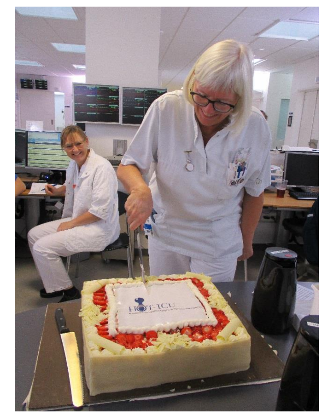
Randomisation number 1000 cake enjoyed in Kolding