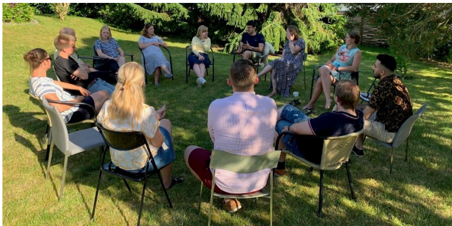
The research unit at North Zealand Hospital at their summer meeting in 2020.

Meanwhile, let's celebrate North Zealand for being top-5 recruiter in CLASSIC!