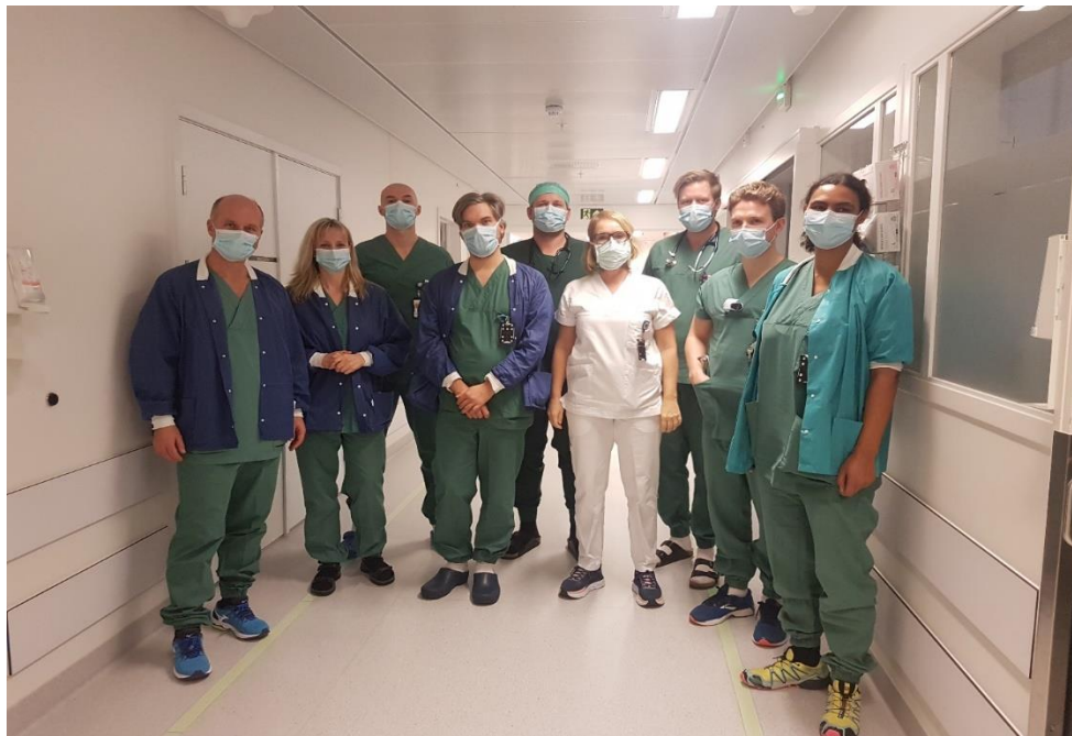
The ICU staff at Hospital Østfold where, currently, 41 patients have been enrolled.