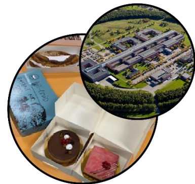
Randomisation nr 500!

Cake is at stake again for randomisation nr 600.