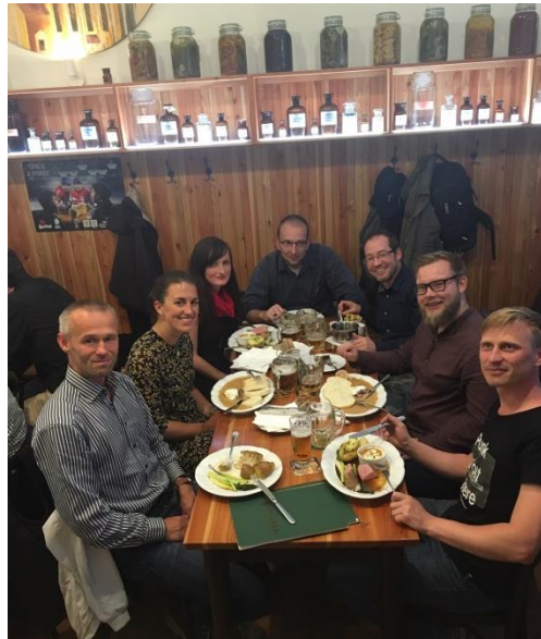
Food and pilsner enjoyed in Pilsen with the Czech team