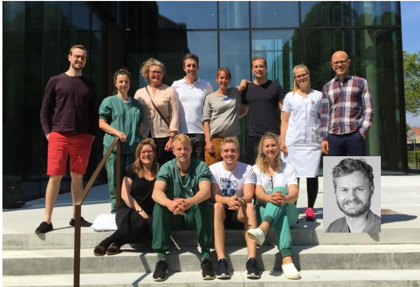
The anesthesia and intensive care research team at Bispebjerg hospital (Denmark) in front of their new research facilities